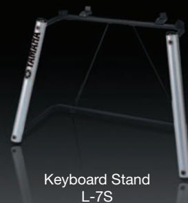
Keyboard Stand L-7S