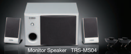
Monitor Speaker TRS-MS04