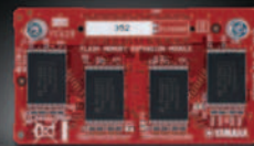
Flash Memory Expansion Module FL512M / FL1024M