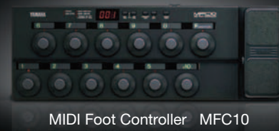
MIDI Foot Controller MFC10