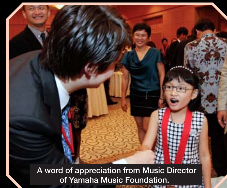
A word of appreciation from Music Director of Yamaha Music Foundation.