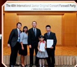
The 40th International Junior Original Concert Farewell Party