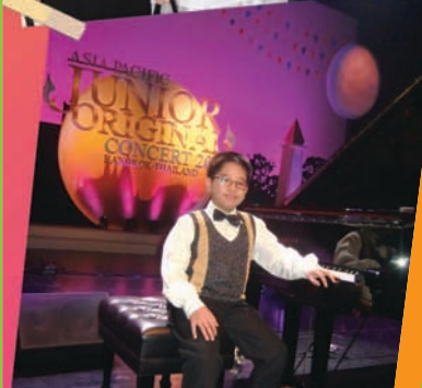
Asia Pacific Junior Original Concert (APJOC)- October 2011