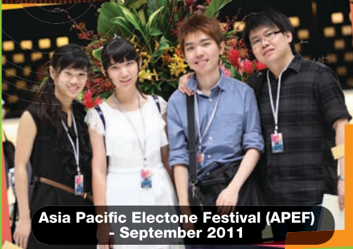
Asia Pacific Electone Festival (APEF) - September 2011