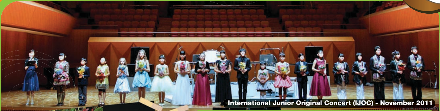
International Junior Original Concert (IJO) - November 2011