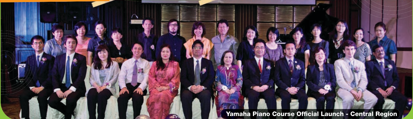
Yamaha Piano Course Official Launch - Central Region