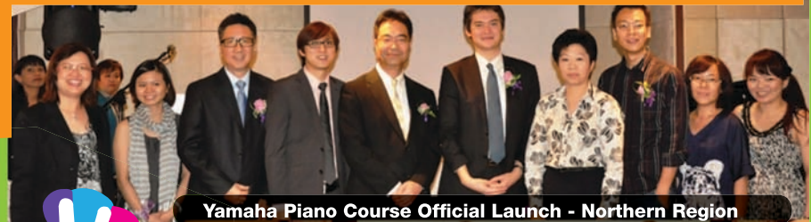
Yamaha Piano Course Official Launch - Northern Region