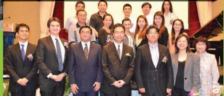
Yamaha Piano Course Official Launch - Southern Region