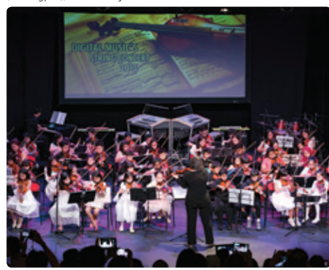
13 DEC 2015 > Talent Time Music Sdn Bhd Annual Concert at Kinta City, Ipoh

Christmas Concert at Penang Performing Arts Centre (Penangpac), Straits Quay