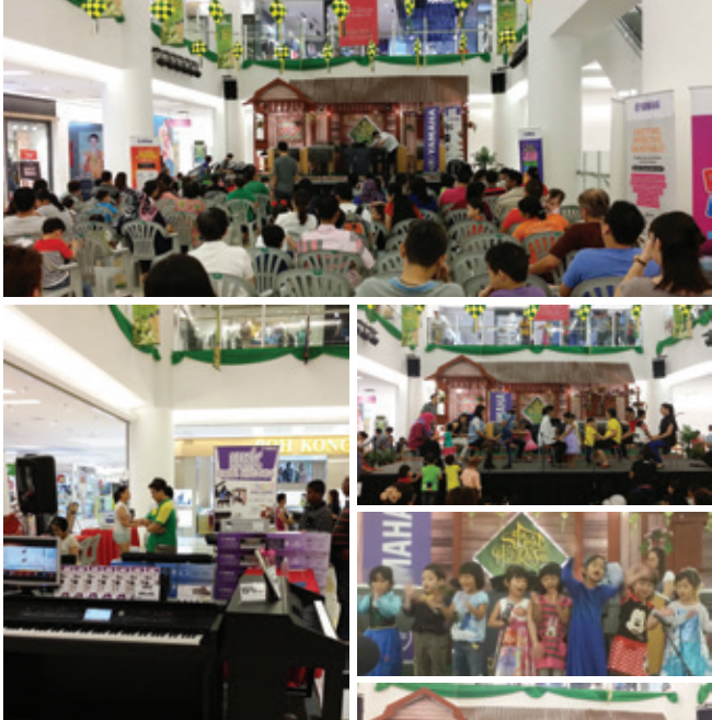
GRAMERCY MUSIC SCHOOL Student Concert at Trader's Hotel, Muar

25 - 26 Jul 2015 Promotion & Concert at Taiping Mall, Taiping